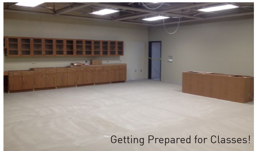
Getting Prepared for Classes!